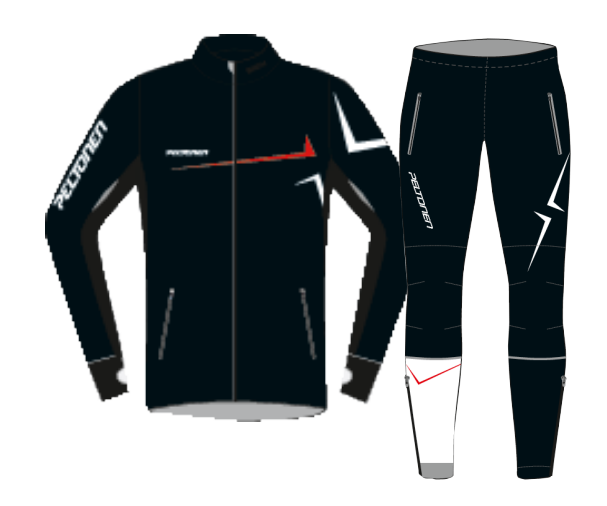
PELTONEN WARMUP JACKET & PANTS Shirt size XS-XXL Shirt size XS-XXL