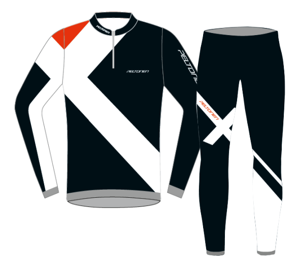
PELTONEN RACE SHIRT & TIGHTS Jacket size XS-XXL Pants size XS-XXL